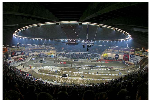
The fantastic atmosphere of Genova

The 2008 Enduro season has officially started, and Metzeler is looking forward to the first World Championship race, which will be held in Sweden (15.-16. March 2008).